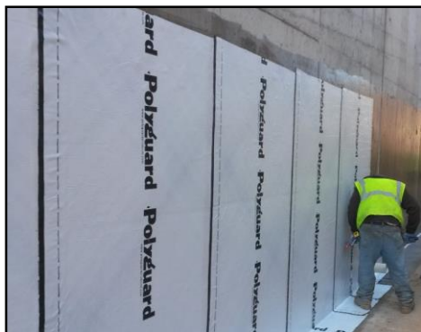
650 Membrane Installation