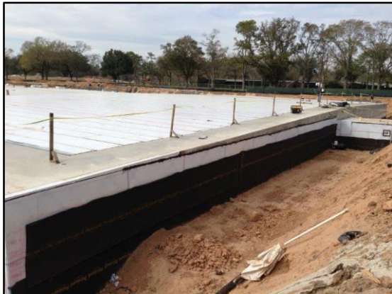
650 Membrane Installation